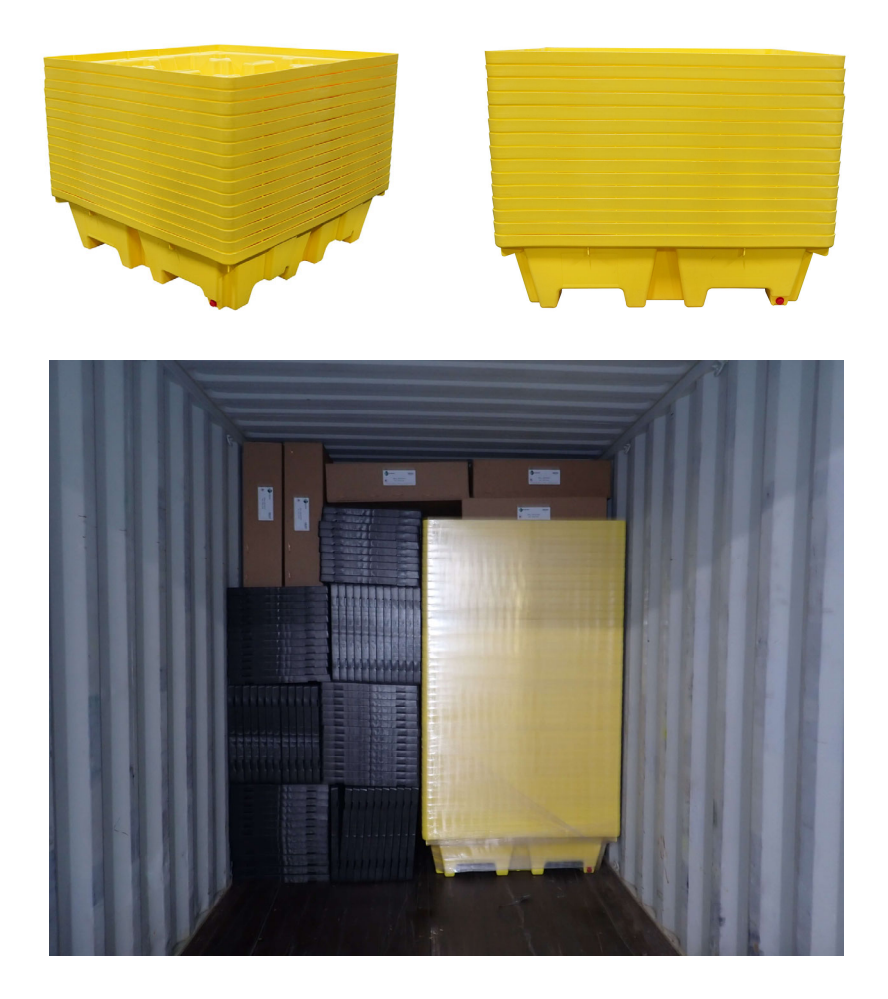
Fork / Pallet-Jack Channel Specifications

Shipping 45 Sumps Per Stack 400+ Per 40'HC Container